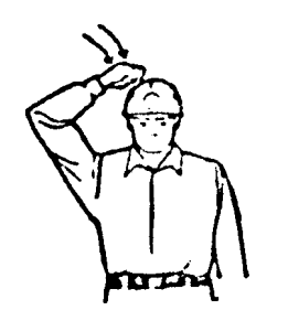
USE MAIN HOOK